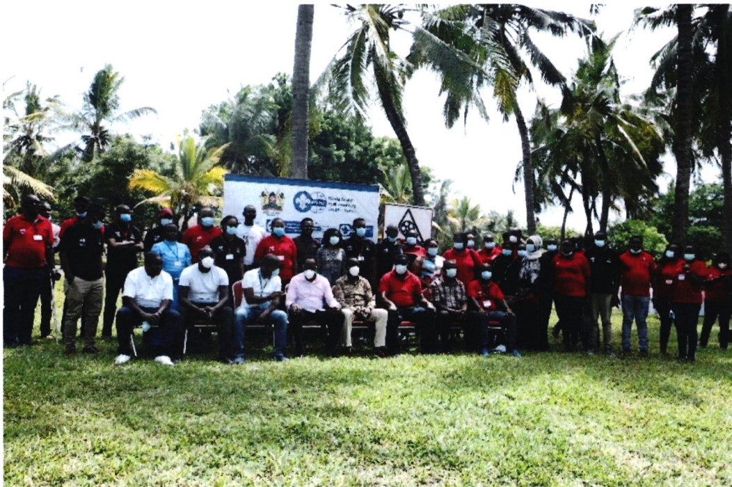
WSPU Induction in Mombasa in 2020 with the Deputy Speaker of the National Assembly, Hon. Moses Cheboi, CBS

The induction was attended by Members of Parliament, Members of County Assemblies, and County executive Committee members in Charge of Youth. During the Induction members were briefed on the WSPU programmes and plans for the following year.