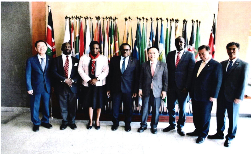
Members of WSPU Korea with the Speaker of the Senate, Hon. Kenneth Lusaka, EGH, MP, Sen. Petronilla Were and Sen. Ltumbesi Lelegwe.