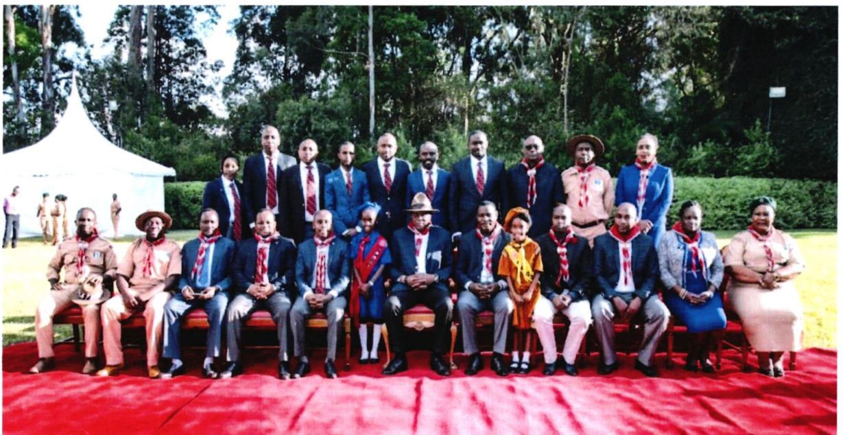
Members of WSPU Kenya with H.E. President Uhuru Kenyatta, CGH during their visit to State House

As per the Constitution of the Kenya Scouts Association which is an act of Parliament, the President of the country automatically becomes the patron of the Association.