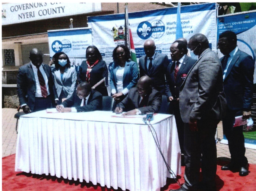
Members of WSPU Kenya and Nyeri County Governor during the MOU signing

The MOU was signed in February 2021 in Nyeri County. WSPU Kenya has plans of setting up the Baden Powell Centre of Excellence and the County Government will provide the required land to set up this joint project.