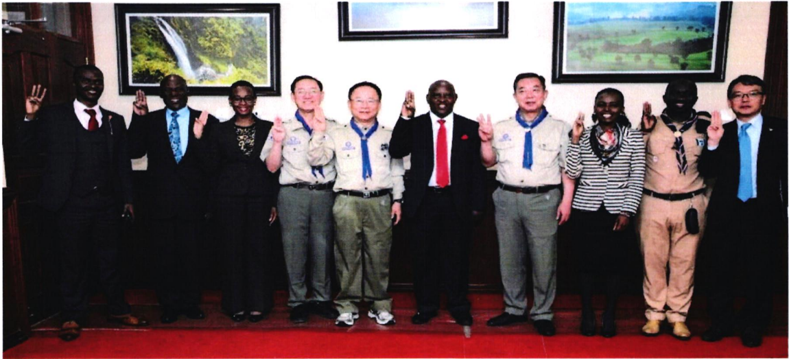
Members of the WSPU Korea with the Governor of Nyeri County H.E. Mutahi Kahiga

The team also visited the proposed WSPU Africa Assembly venue in Nyeri and met the Governor of Nyeri H.E. Mutahi Kahiga who also assured them of the County Government of Nyeri's support.