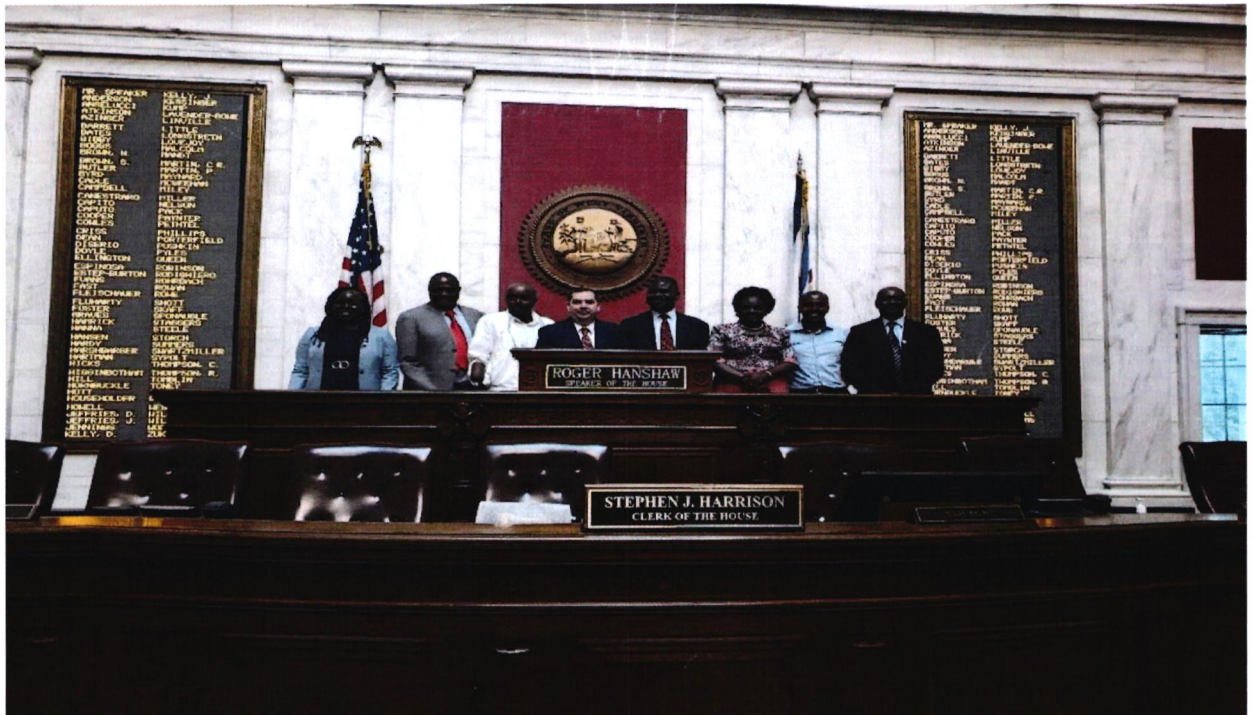
WSPU Kenya delegation at the West Virginia Legislature

The delegation also had an opportunity on the sidelines of the Jamboree to benchmark with their counterparts from at the West Virginia Legislature.