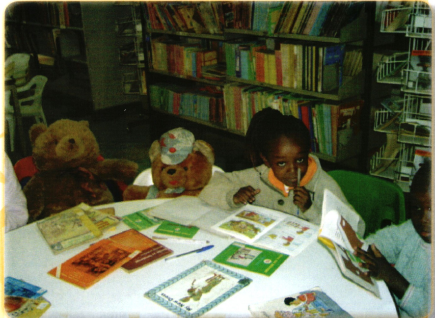
This junior reader prefers to have dolls seated by her side as she enjoys a variety of books at the library.

The achievements attained by the Board were made possible by the continued government support. During the year under review, the government increased its support to KNLS in terms of book grant to by Ksh. 10 million. KNLS also received support to Community Based Libraries (CBLs) amounting to Ksh. 10 million. This was in recognition of the important role that KNLS is playing in empowering communities through information dissemination.