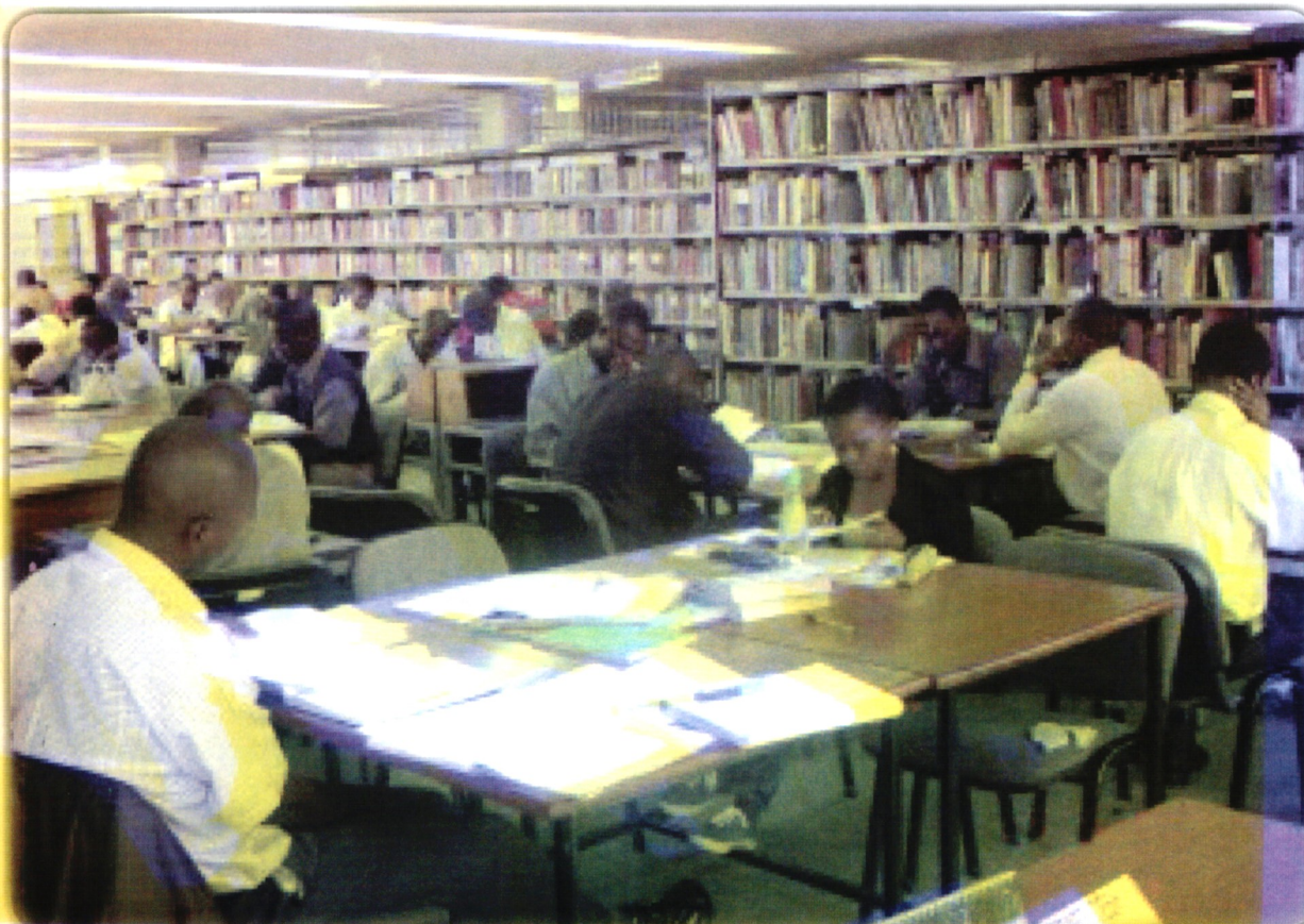
A section of readers at KNLS

Libraries. Prior to that, the entire Coast Province was only being served by two KNLS libraries; the Mombasa Provincial and Wundanyi District Libraries. This was therefore a major milestone in the provision of library services to the Coast Province publics.