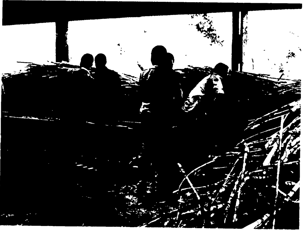
Inside Kabras Sugar Factory at R.I.D.C., Kakamega.