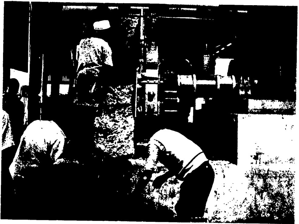
Inside Kabras Sugar Factory at R.I.D.C., Kakamega.