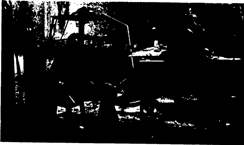
Farm Implement Factory at Nakuru