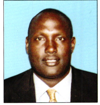
Maison Sasai Director